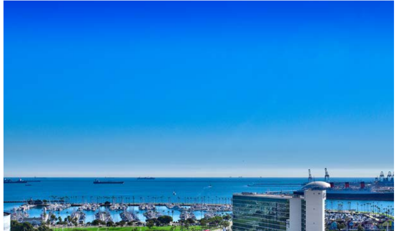
SPECTACULAR UNOBSTRUCTED OCEAN VIEWS