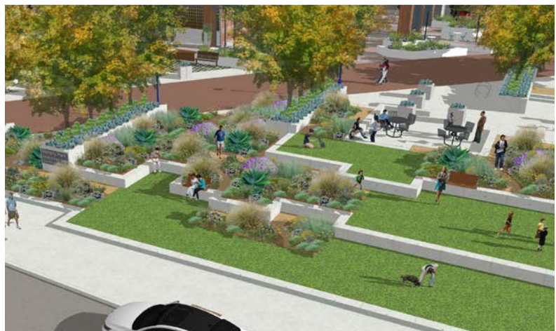
NEWLY LANDSCAPED VICTORY PARK