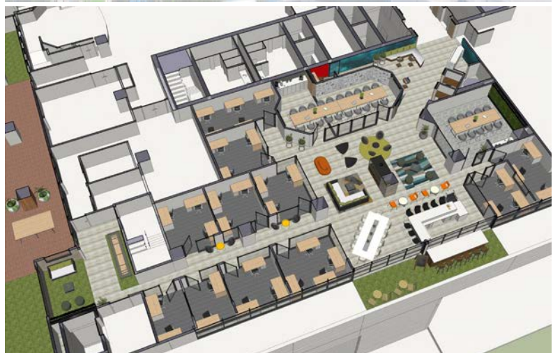
TENANT AMENITY LOUNGE, CONFERENCE ROOMS & CO-WORKING SPACE